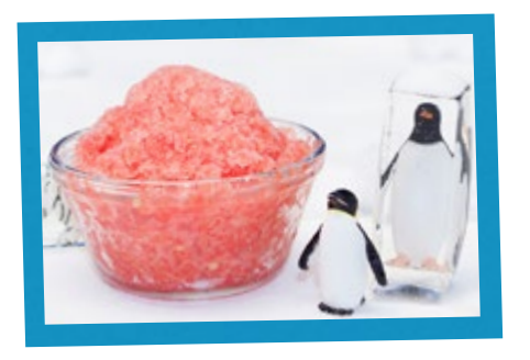
SERVES 3 slushes