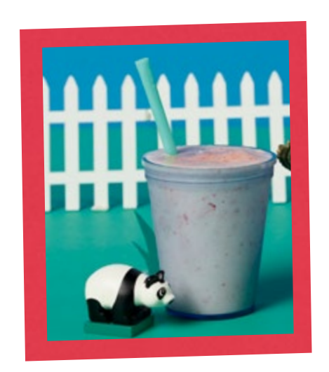
MAKES 1 smoothie