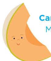
Cantaloupe May 1-20