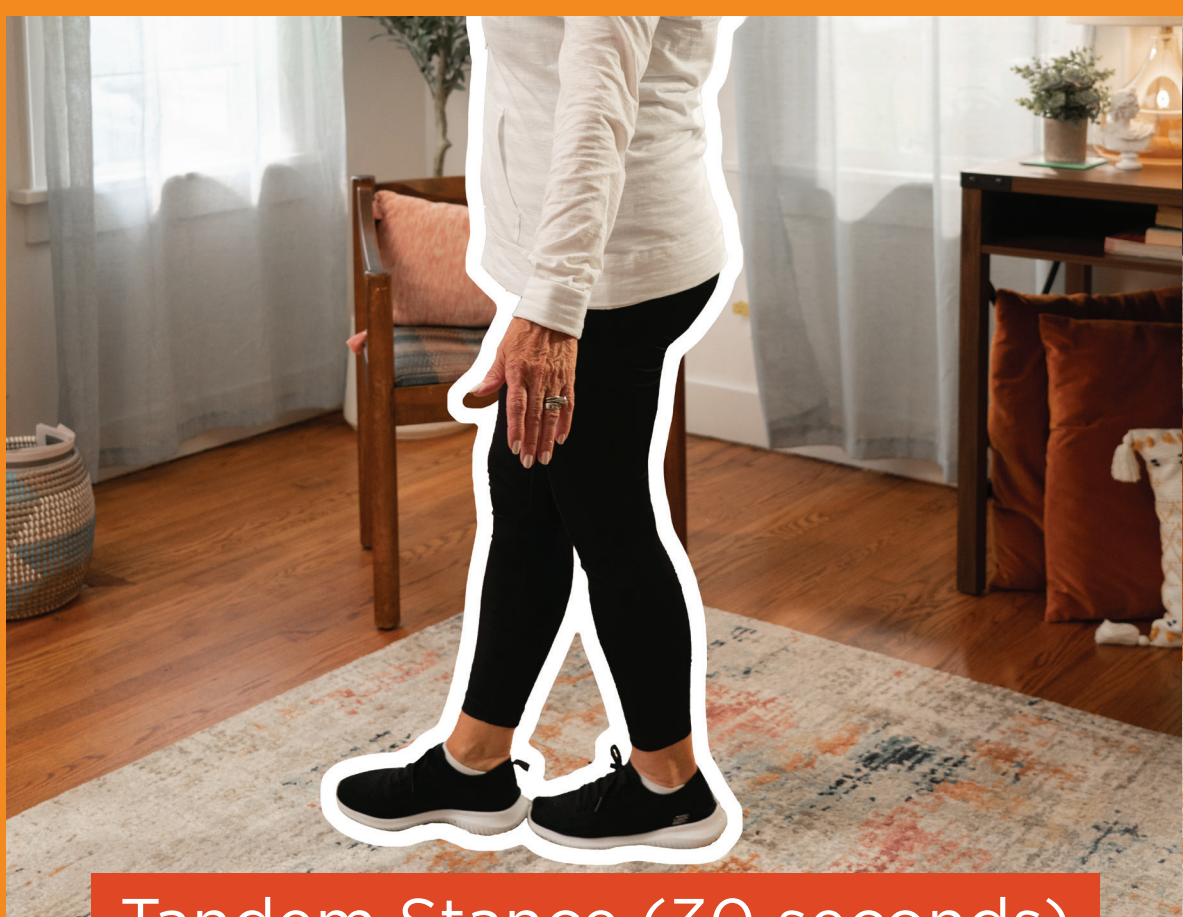
Tandem Stance (30 seconds)