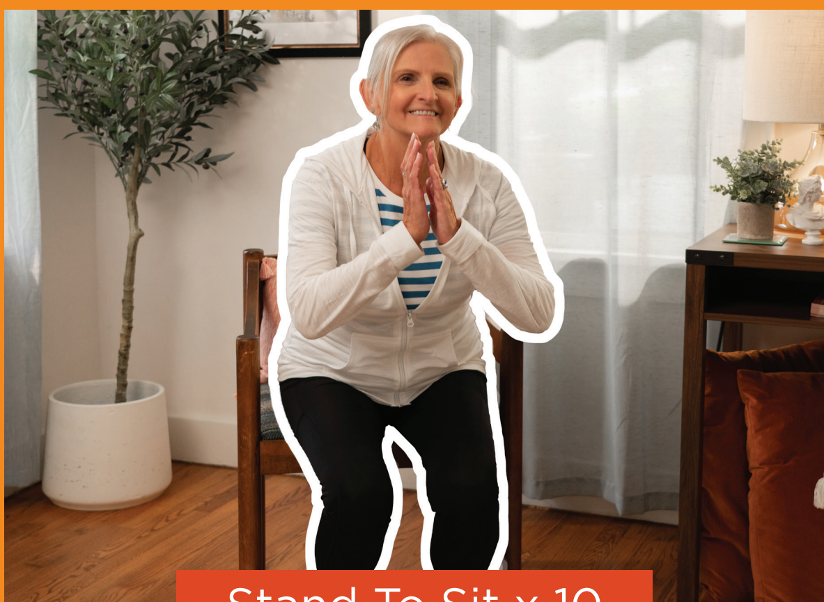
Stand To Sit x 10