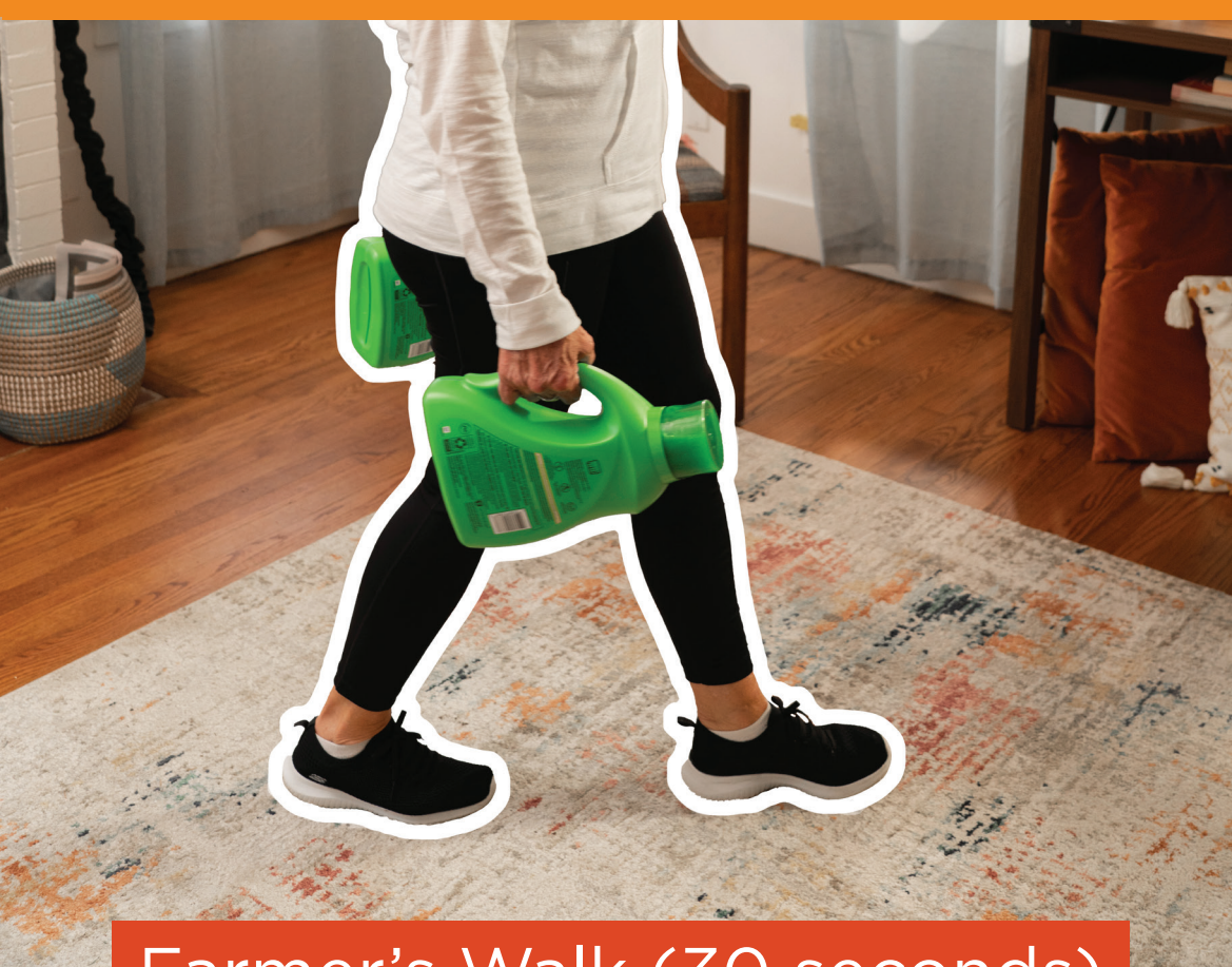
Farmer's Walk (30 seconds)