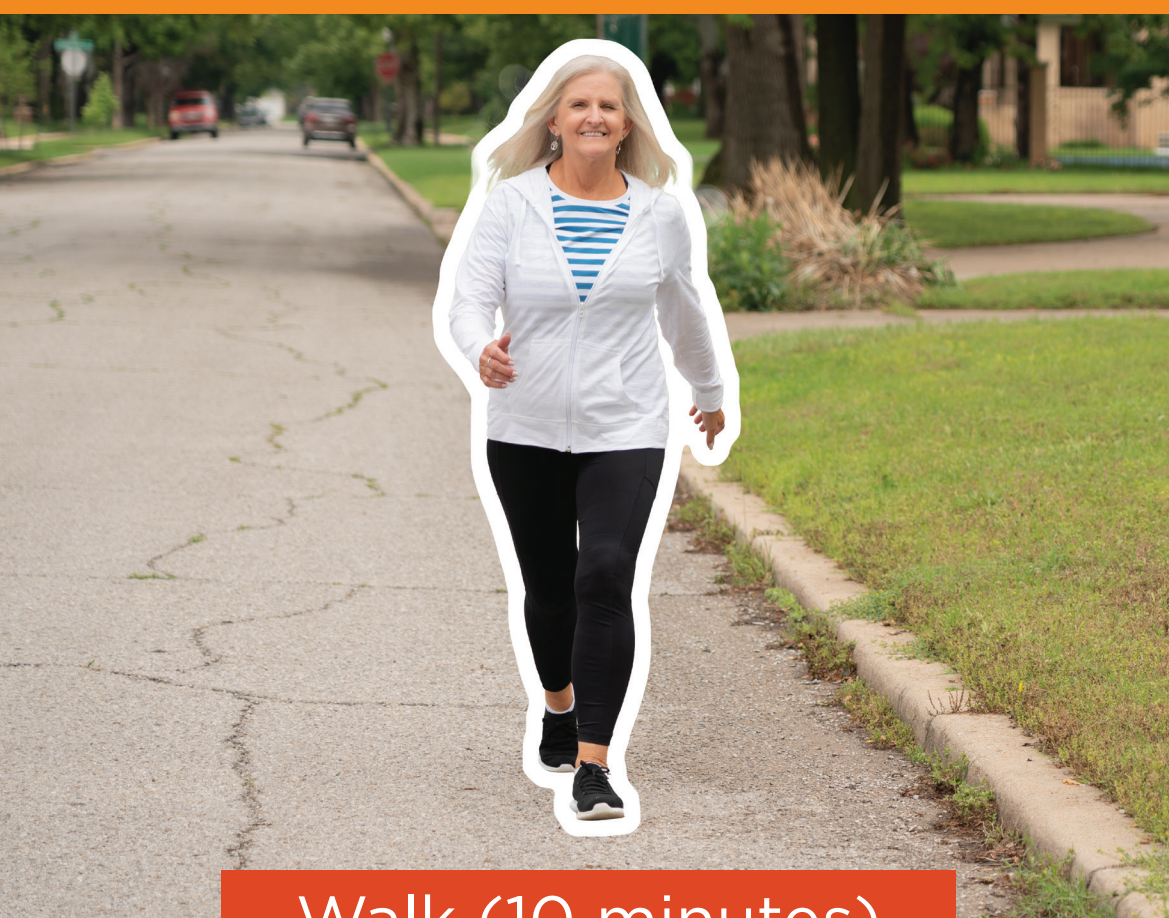
Walk (10 minutes)