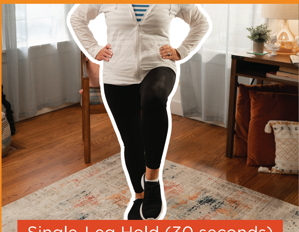
Single-Leg Hold (30 seconds)